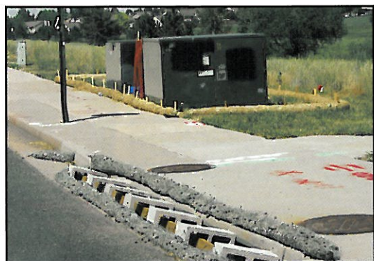
Silt fence and undisturbed vegetative buffers, right, serve as perimeter controls for non-potable water pipe installation. Straw wattle perimeter control and inlet protection safeguard water quality during underground electrical construction.

Linear wet and dry utility projects present both challenges and opportunities for utility providers and the municipalities in which this type of construction occurs.