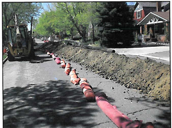
Rock socks at street crown confine temporary stockpiles to one side of street.

In addition to the Umbrella SWMP template for wet and dry utility construction projects, the project team also recognized the need for improved stormwater guidance for small, routine projects (typically less than one acre in areas without special concerns related to steep slopes, highly erosive soils, and/or proximity to wetlands and receiving waters) and maintenance activities that generally do not require a permit from Denver or the State. To address this need, a guidance document was developed, incorporating many of the Typical from the Umbrella SWMP, to establish standard procedures and practices